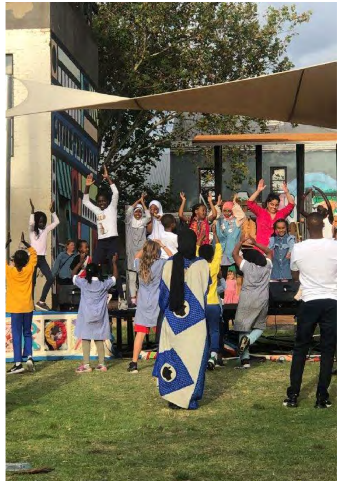
Community event at the Fitzroy Learning Network