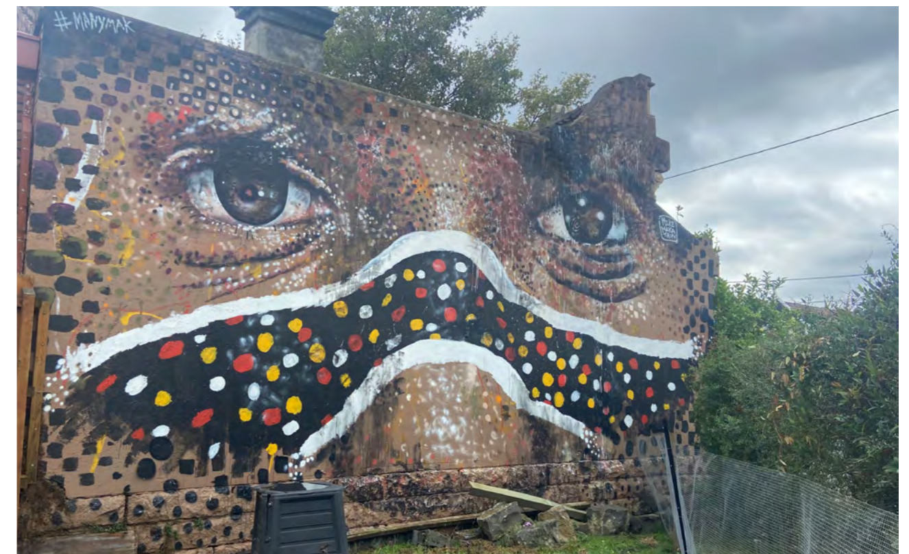
Ballum Ballum garden at the Carlton Neighbourhood Learning Centre